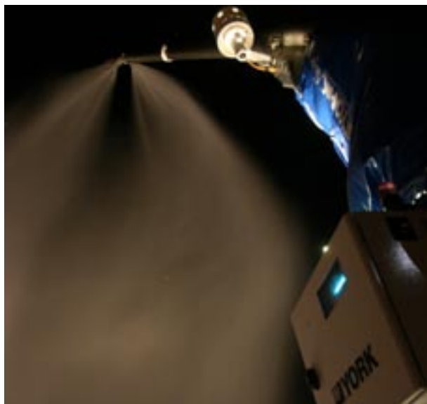
The new generation snow cannon. Serre Chevalier has one of the widest networks of artificial snow in Europe with 146 hectares of its ski area covered.