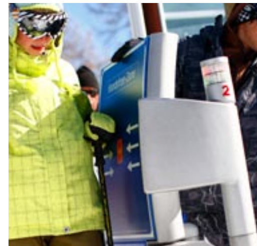
Don't forget you can recycle your ski passes.

- If you are not sure that you will come back or re-use the card, leave it in one of the recycling bins put at your disposal in the ski area or bring it back to the sales desk.